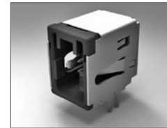
0.50 Header (H)