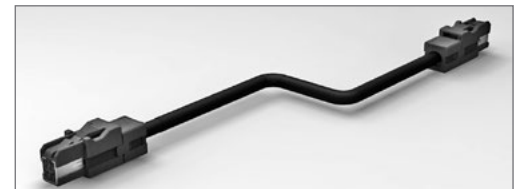
0.50 HSL Harness